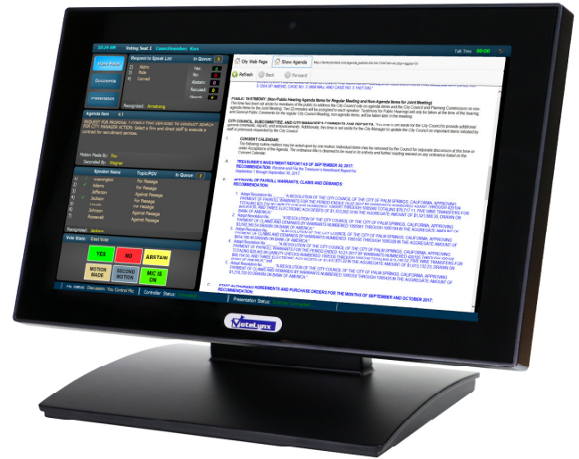
Member's Desktop Graphic User Station showing dashboard and agenda