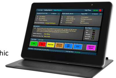
Desktop 7" Graphic User Station