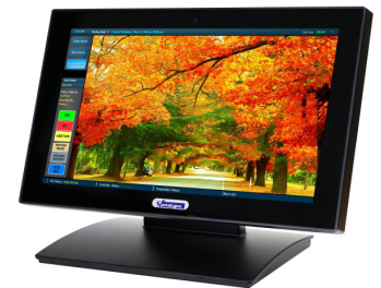
Desktop Graphic User Station Showing live video from presentation or Zoom